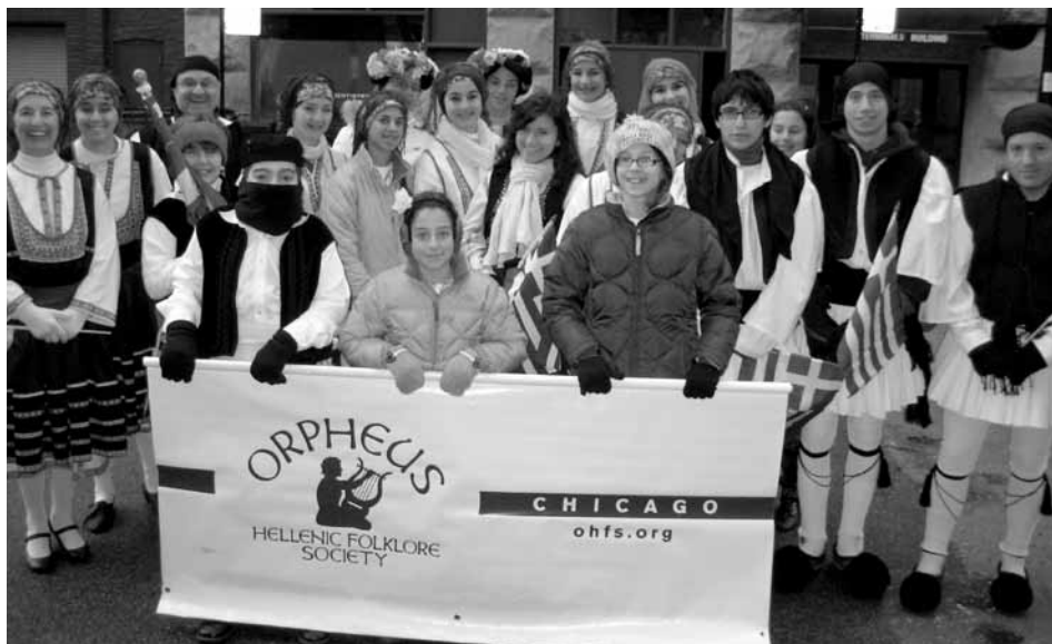
Orpheus members woke up extra early and braved the cold weather on Thanksgiving morning to participate in the 77th annual McDonald's Thanksgiving Parade.

In a few hours, the parade was over and Orpheus members headed home to enjoy the holiday feast with their families, and no doubt, watch some of the parade highlights reliving the morning's excitement! ☒