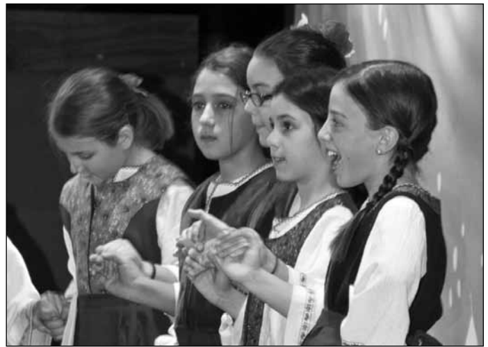
Youth Group I members started the presentation at the "Christmas Around the World" event at the Museum of Science and Industry.