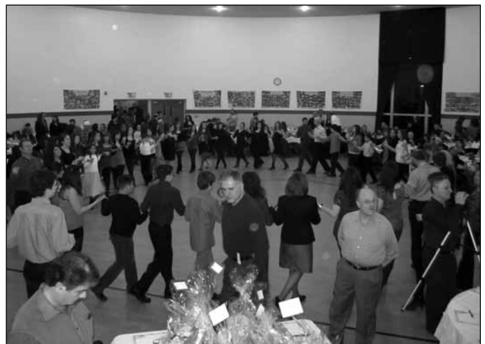
Guests enjoying themselves at the OHFS Vasilopita event.