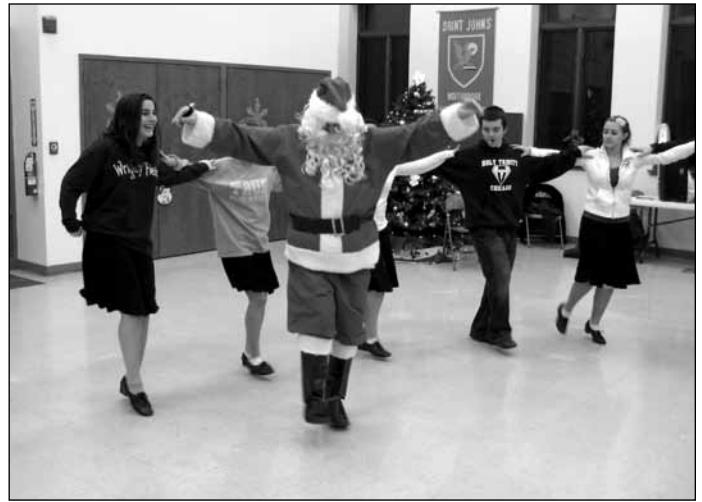
Orpheus youth group members got a surprise visit from Santa Claus at the Glenview and Northbrook practice locations. In addition to getting everyone in the Christmas spirit, Santa passed out candy, posed for photos and showed off his dance moves!