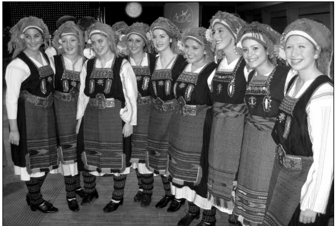
Members of the OHFS Advanced Youth Group pose for photos, after presenting a suite of dances from Anatoliki Romilia, during day two of the AGDC competition.