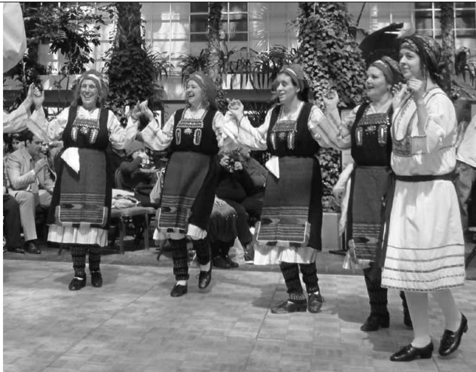
Orpheus adult group members performing dances from mainland Greece.