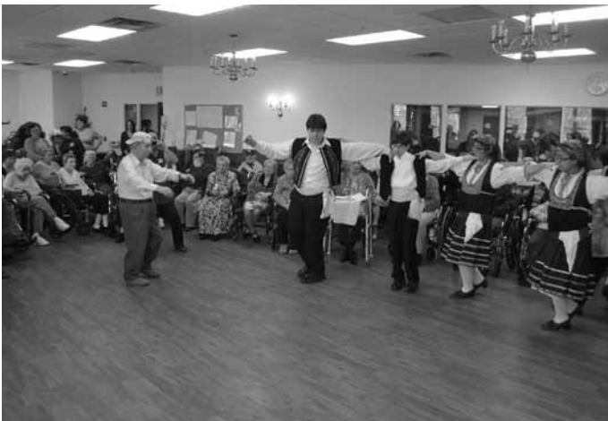
Orpheus youth group members performed for the residents of the Greek American Rehabilitation and Care Centre.