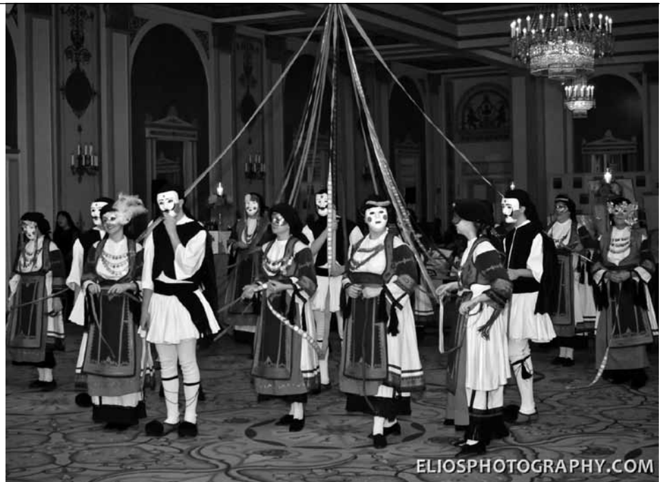
Orpheus members ready to perform the Gaitanaki dance at the beginning of the presentation.

The culmination of the Orpheus Dance Troupe’s participation was a flamboyant presentation of the dance, “Gaitanaki” (Maypole Dance). The Orpheus dancers wove their way around the Gaitanaki with their colorful ribbons, dressed in traditional costumes and wearing masquerade masks, while the dance was projected above with the Gaitanaki being performed in Greece. The Orpheus Dancers truly