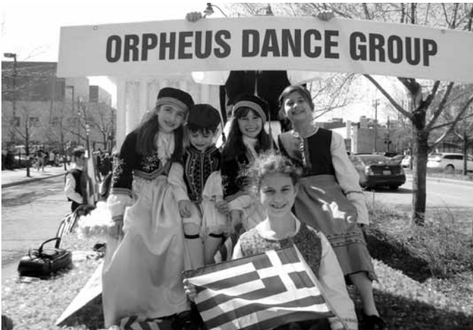
Hellenic pride was everywhere at the Greek American parade, especially on the Orpheus float where youngsters proudly waved their Greek flags.