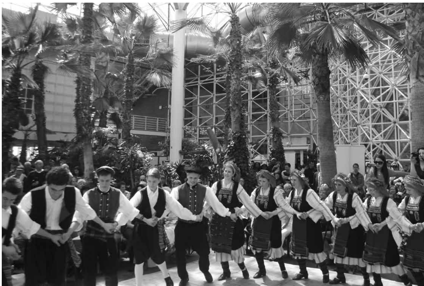
Orpheus adult and Nea Genia members entertaining the crowd at Navy Pier.