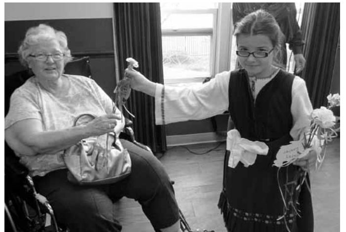
After the performance, youth group members got the chance to meet the residents of the Centre and present them with flowers.