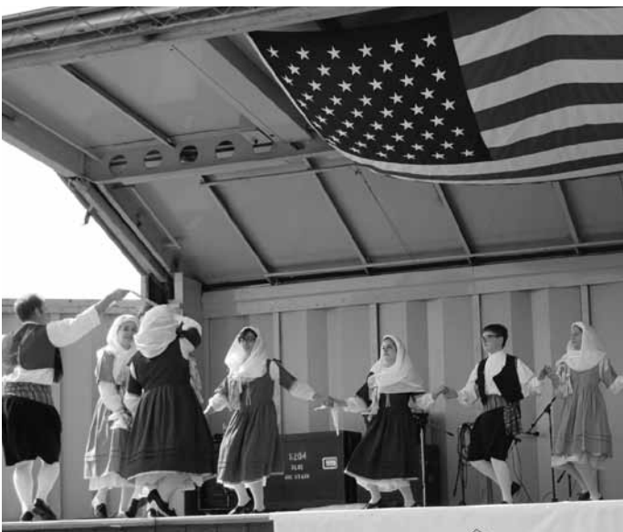
Orpheus Adult and Nea Genia members performed at the Skokie Festival of Cultures. Orpheus has been performing at this event for almost 20 years.