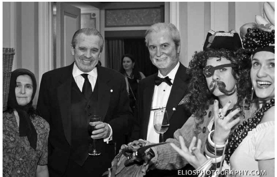
Revelers mingled with guests during the cocktail hour.

island of Skyros and the Gaitanaki (maypole) dance that is performed in several Greek regions. After a few weeks of research and planning, the stage was set for the execution of those ideas. Indeed, that presentation would be a bold statement during a black tie event, as revelers in various carnival costumes would also complement the folk performers. Staff from the Museum was able to track down, assemble and provide many of the accessories required. The Orpheus members, from their end, went hard at work researching and making their costumes, as well as looking into resources for the proper execution of all the various components of the performance. This presentation energized Orpheus to the point where even several of its alumni came out of “retirement” to be part of the fun and excitement! It is very fulfilling to explore the vast world of Greek folk traditions, where the depth and variety of customs for all types of occasions are without any bounds.