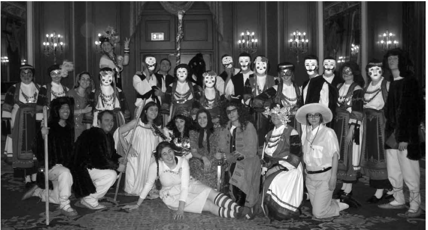
Group shot of the performers after the Apokries presentation.