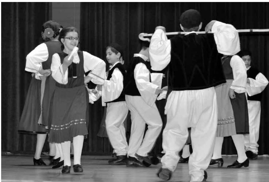
Youth group members demonstrating the fruits of their labors.

For more information about the Orpheus Youth Group, Music Group, or other inquiries, please visit our website at www.ohfs.org . ☐