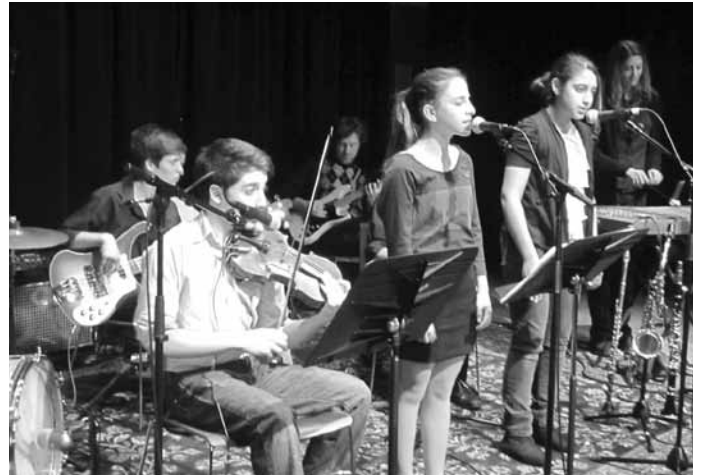
Orpheus Music Group performed during a workshop at the Old Town School of Folk Music.