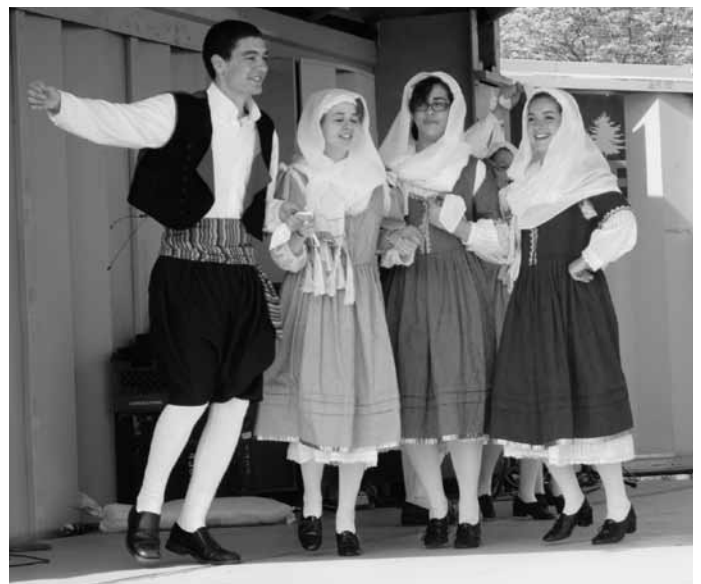
Nea Genia members performing the dance, Pyrgousikos, during the Skokie Festival of Cultures.