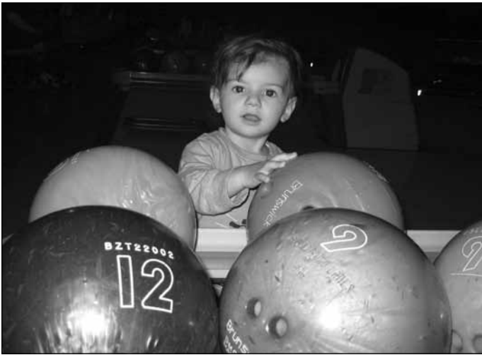
Even though some were too little to participate, Orpheus members and their families had a chance to get together for an afternoon of bowling, pizza, dancing and fun during the Christmas break.