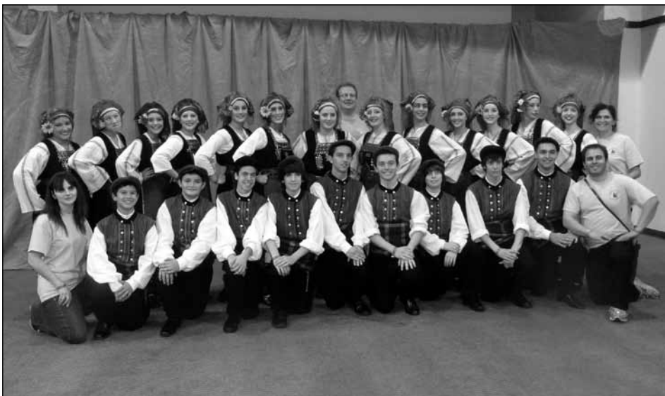
AGDC participants and instructors smile for the paparazzi after completing the Finals round.