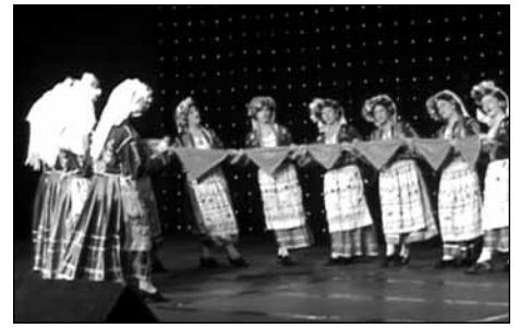
Girls performing "Ai Giorgis", wearing the Corfu costume which won the Costume Award at the AGDC competition.

Boyialiki, Anatoliki Romilia, was the chosen area of Greece to be represented in the Finals round, giving the dancers the opportunity to represent both the Greek islands and mainland during the course of the weekend. The suite opened with the spirited, "Sarantata" dance and continued with other upbeat dances, such as, "Troirou",