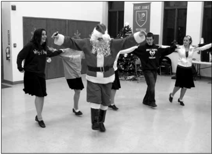
Orpheus youth group members got a surprise visit from Santa Claus at the Glenview and Northbrook practice locations. In addition to getting everyone in the Christmas spirit, Santa passed out candy, posed for photos and showed off his dance moves!