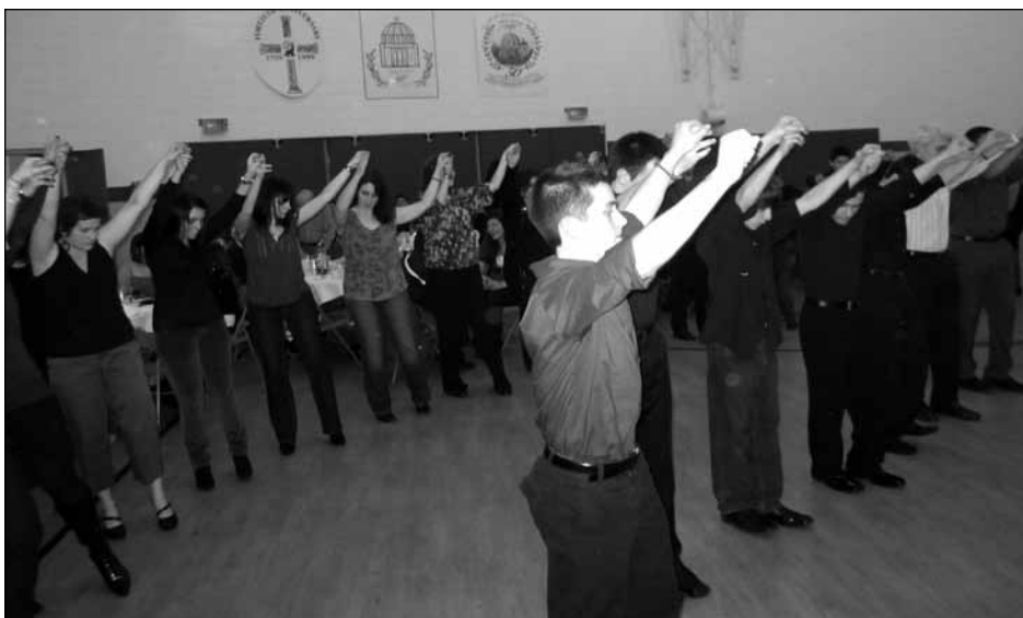
Orpheus members showing off their moves and having fun with dances from Pontos.

It is always wonderful to see Orpheus members, friends and family coming together and enjoying themselves at events such as this. It is encouraging and inspiring to know that members of Chicago's Greek American community are passing down the rich culture and traditions of Greece to future generations. This has always been part of Orpheus' mission statement, and it is events like this that keep inspiring us to do what we do. See you next year! ☐