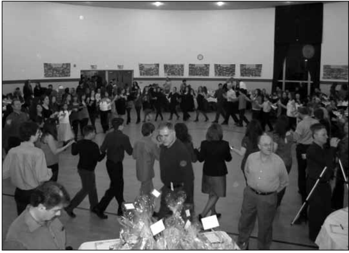
Guests enjoying themselves at the OHFS Vasilopita event.