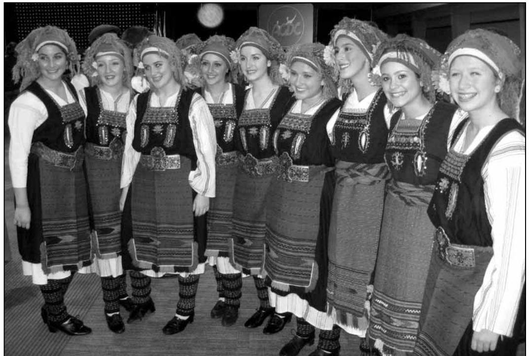
Members of the OHFS Advanced Youth Group pose for photos, after presenting a suite of dances from Anatoliki Romilia, during day two of the AGDC competition.