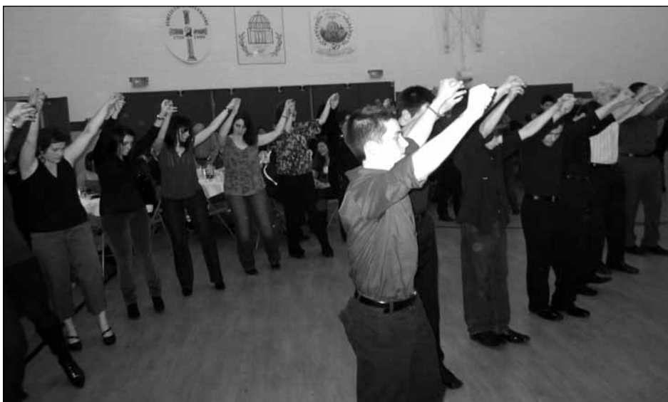
Orpheus members showing off their moves and having fun with dances from Pontos.

It is always wonderful to see Orpheus members, friends and family coming together and enjoying themselves at events such as this. It is encouraging and inspiring to know that members of Chicago's Greek American community are passing down the rich culture and traditions of Greece to future generations. This has always been part of Orpheus' mission statement, and it is events like this that keep inspiring us to do what we do. See you next year! ☐