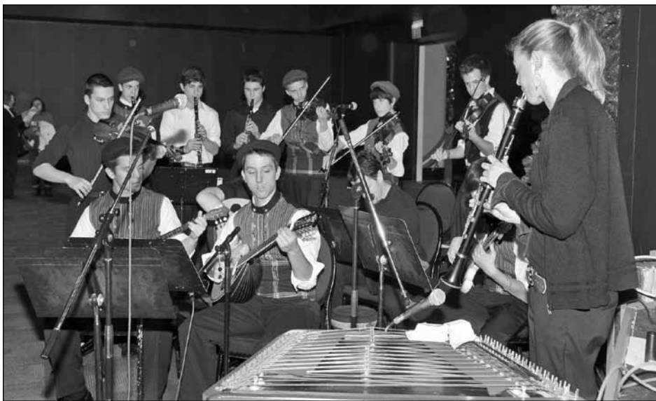
The OHFS Music Group and singers provided live music for the dancers at the Museum of Science and Industry's, "Christmas Around the World" event.

To view and order photos and video of the event, please visit our website, www.ohfs.org or visit us on Facebook. 📷