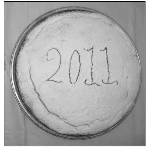
With a Vasilopita at each table, there were several lucky coin winners that night.