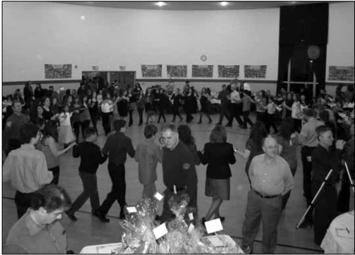
Guests enjoying themselves at the OHFS Vasilopita event.