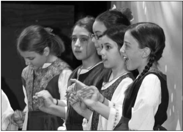
Youth Group I members started the presentation at the "Christmas Around the World" event at the Museum of Science and Industry.