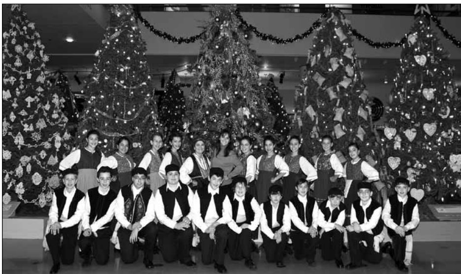
Youth group members pose in front of the Hellenic Christmas tree, which featured decorations such as mini tsarouchia and petit "Amalia" and "Tsolia" dolls.