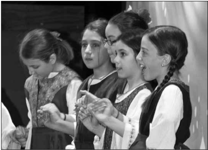
Youth Group I members started the presentation at the "Christmas Around the World" event at the Museum of Science and Industry.