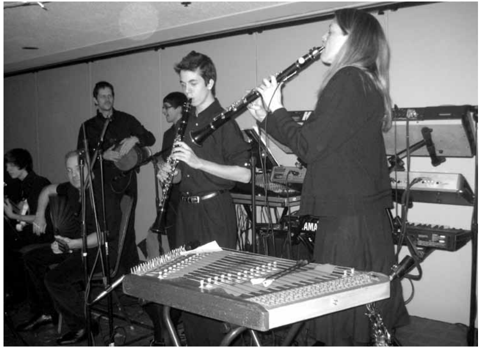
Members of the OHFS Music Ensemble, doing what they do best, at the KYKLOS anniversary dinner dance.

The event was attended by 300 people, including His Eminence Metropolitan Nicholas Of Detroit. Following dinner the KYKLOS dance