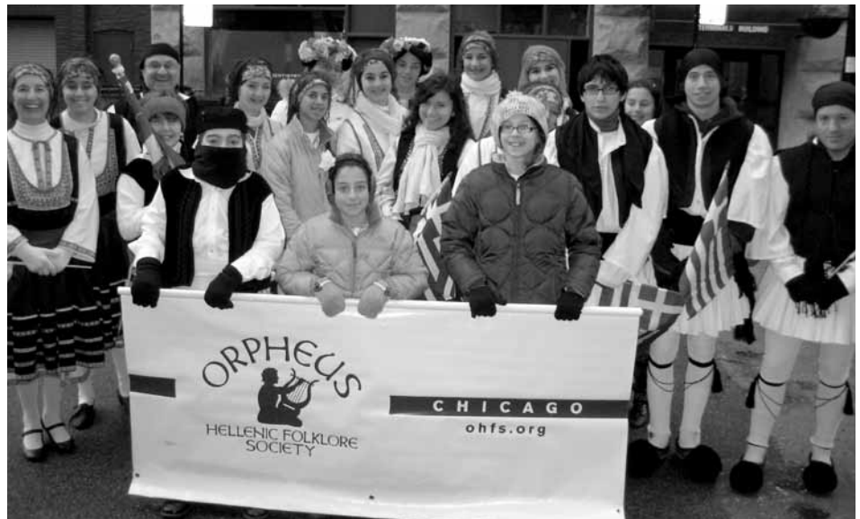
Orpheus members woke up extra early and braved the cold weather on Thanksgiving morning to participate in the 77th annual McDonald's Thanksgiving Parade.

In a few hours, the parade was over and Orpheus members headed home to enjoy the holiday feast with their families, and no doubt, watch some of the parade highlights reliving the morning's excitement! ☒