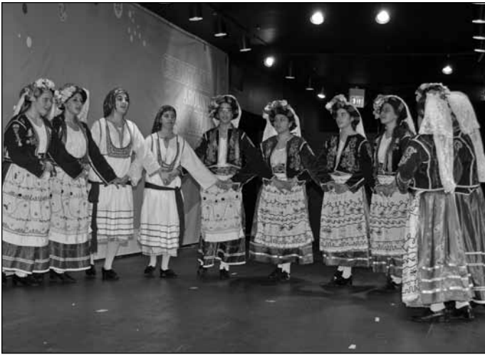
Youth Group III members performing island dances at the popular "Christmas Around the World" event at the Museum of Science and Industry.