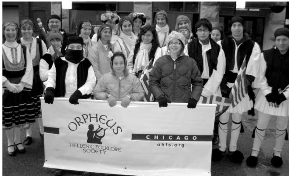
Orpheus members woke up extra early and braved the cold weather on Thanksgiving morning to participate in the 77th annual McDonald's Thanksgiving Parade.

In a few hours, the parade was over and Orpheus members headed home to enjoy the holiday feast with their families, and no doubt, watch some of the parade highlights reliving the morning's excitement! ☒