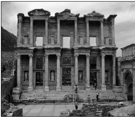
The ruins at Ephesus are an excellent example of the marvels of the ancient world. The Temple of Artemis at Ephesus, which has since been destroyed, was named one of the Seven Wonders of the Ancient World.