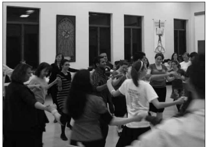
Orpheus members dancing with their new French friends at the Orpheus practice location in Northbrook.