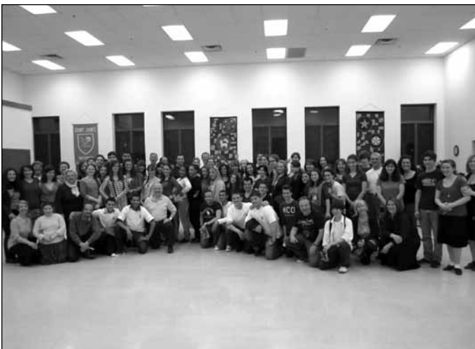
Members of the Greek dance troupe, Parthenon, and the Serbian dance troupe, Mladost visited Orpheus all the way from Paris, France! The visiting dance groups were in Chicago to present a special dance performance entitled, "All That Folk".