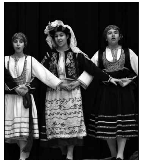
Youth group members performing the girls' dance, "Trata" from Megara.