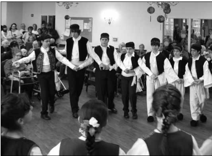
Youth group members performing for the residents of the Greek American Nursing and Rehabilitation Centre.