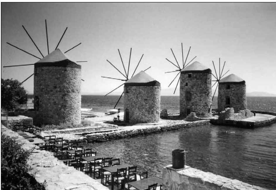
Visitors and locals can stop by the Milarakia and enjoy a meal or a drink while savoring the picturesque surroundings.

Kalo taxidi everyone— see you in Athens and Chios! ☐