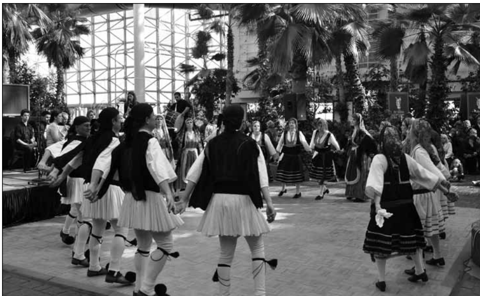
Orpheus performing at the ‘Neighborhoods of the World’ event at Chicago’s Navy Pier.