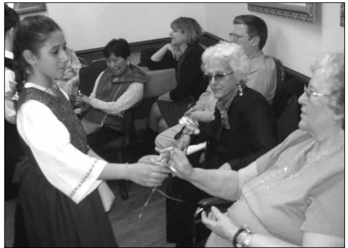
After the performance, Orpheus members had the chance to meet some of the residents of the Centre and present them with flowers.