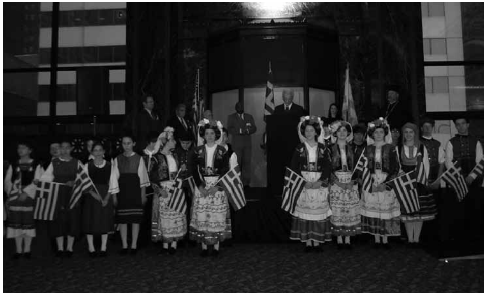
Members of the Orpheus youth group during the opening remarks at the Greek Independence Day reception at the Chicago Cultural Center.