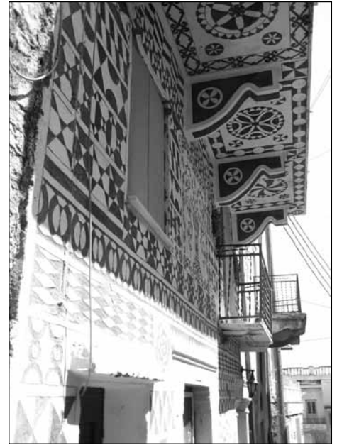
A sample of the beautiful architecture in the village of Pyrgi.

Before the invasion of Chios begins, Orpheus members will have the fantastic opportunity to perform in Athens at the prestigious Deree College (American College of Greece). Deree College is the oldest American academic institution in Europe, with a state-of-the-art campus. This will be a wonderful opportunity for friends and family members, who otherwise would not get a chance to attend a