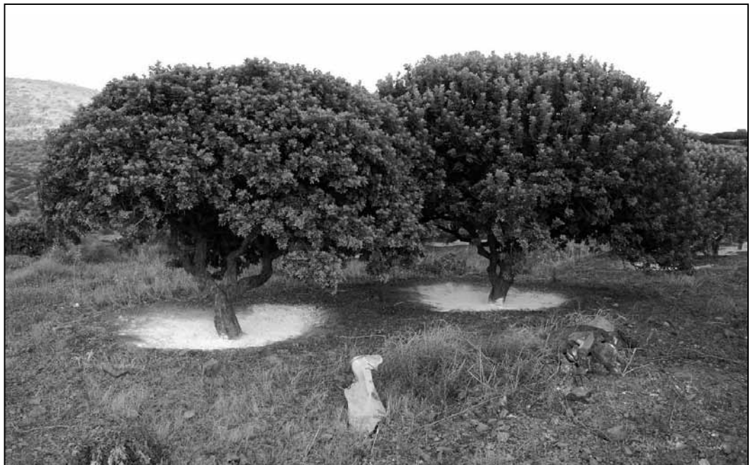
Mastic trees produce mastic, one of the main exports of Chios. Mastic elements can be found in a wide variety of products including, gum, medicinal items, varnishes and lotions.