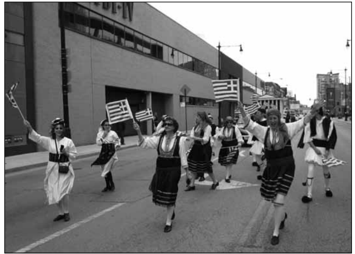
Greek pride and enthusiasm were abundant as Orpheus parade participants marched down Halsted street.