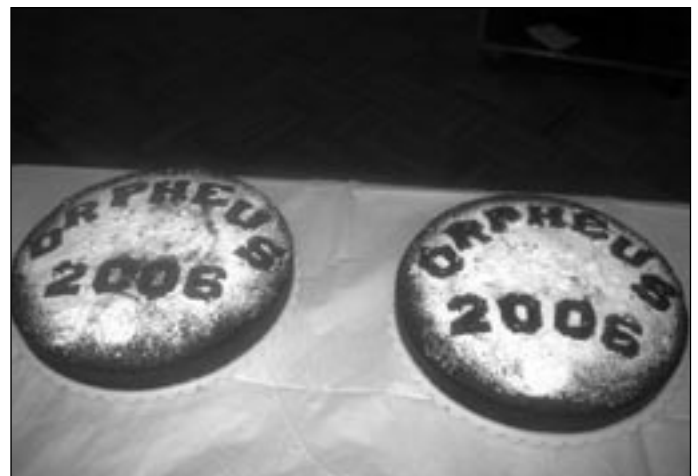
Homemade Vasilopites that were prepared for the night. Members and friends of the Orpheus Hellenic Folklore Society gathered to celebrate the annual Vasilopita event, an evening that featured a presentation of several choral pieces under the direction of Eftihia Papageorgiou, music by the Orpheus music ensemble and plenty of dancing.