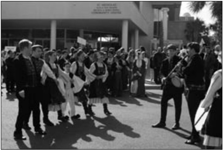
Members of the Orpheus dance group helped jump start the music and dancing while waiting for the Epiphany procession to begin. It was a brisk and clear day that warmed up with singing and dancing.

For additional pictures from the Epiphany and Winter Dance Conference events visit the web site of the Orpheus Hellenic Folklore Society, at www.ohfs.org . ☐