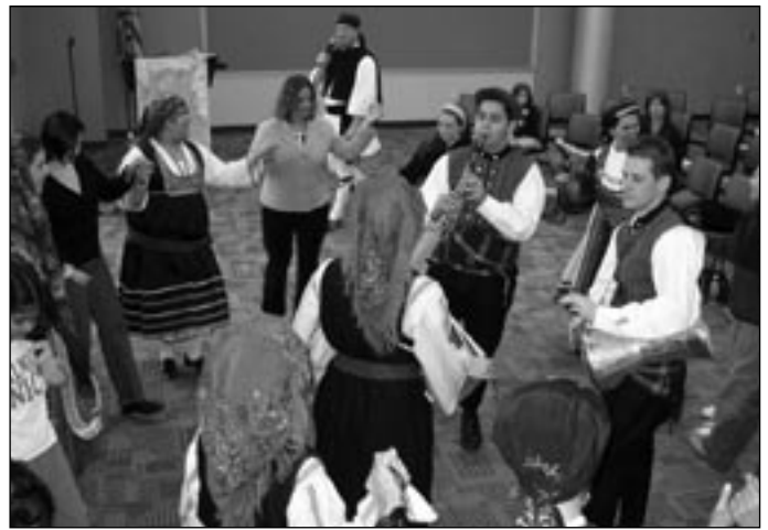
Orpheus members presented a suite of dances at the Naperville Public Library accompanied by members of the Orpheus music ensemble. At the conclusion of the presentation members of the audience joined Orpheus for an impromptu Greek dance lesson.