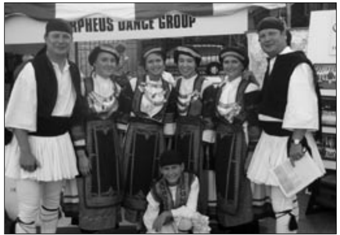
Orpheus members in front of the Orpheus Dance Group booth during the 2005 Greek Town Festival.