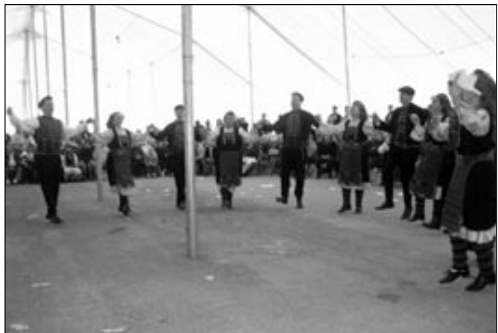
The Orpheus dance group performed a suite of dances from the region of Thrace at the Sponge Docks. About 12 groups from the U.S. and Canada had the opportunity to showcase Greek folk dances.