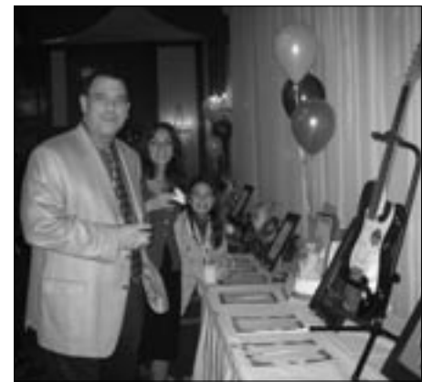
Guests had a chance to bid on auction items that included an array of items from musical instruments to Christmas decorations and much more!

My favorite place in Greece: The beaches in Finikouda, Messinia. I can walk around and everyone knows me. I get a lot of free ice-cream!