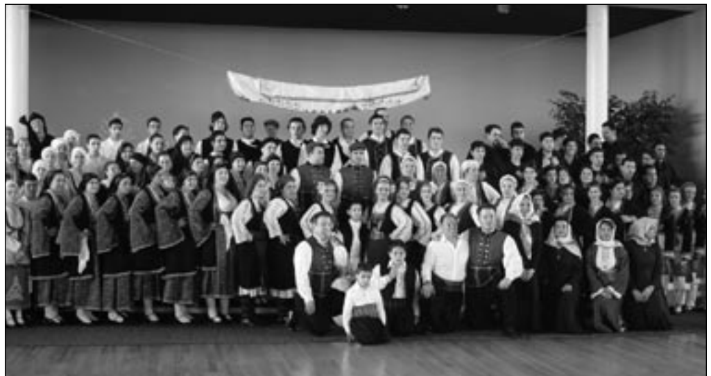
Members of participating Winter Dance Conference dance groups pose for a picture at St. Nicholas Community Center moments before the procession for the Centennial Epiphany Celebration begins.

The Winter Dance Conference includes a series of workshops on Greek folk traditions in the areas of dance, music and costumes. The workshops are conducted by renowned instructors from Greece, the U.S. and Canada. This year, registration reached capacity as over 250 participants visited this historic Greek community. Conference members, apart from attending all day workshops and Continued on page 2