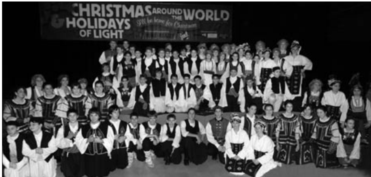
The Orpheus youth group pose for a picture after their presentation at the Christmas Around the World festivities at the Museum of Science and Industry.