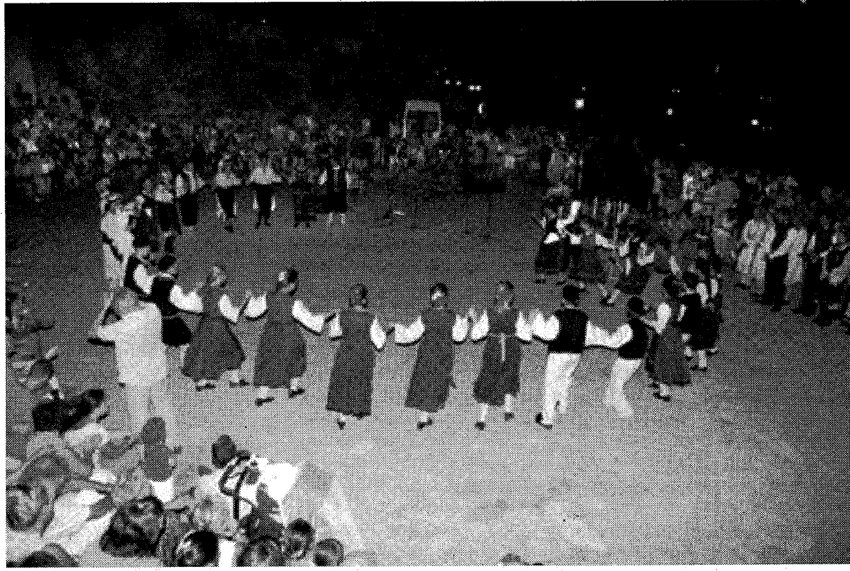
Members of the Orpheus Youth Group perform at Finikounta Beach in Messinia, Greece during their weekly tour of the area during the last week of July.

Another performance was given in Ancient Messini, in the village of Mavrommati. Besides the energetic singing and dancing, members of the troupe gave insightful and moving speeches about what this experience meant to them. Many of the dancers, particularly the younger ones, commented that this trip was exceptionally meaningful to them. Not